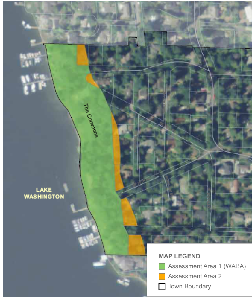
Figure 1. Beaux Arts Village Shoreline Reaches